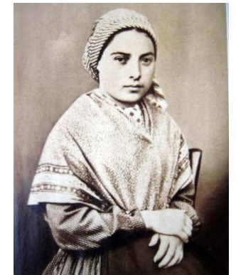
St Bernadette of Lourdes 1844-1879